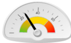
Killed Seriously Injured Casualties