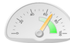
% public who believe NYP/Councils deal with