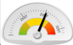
Total Crime Recorded