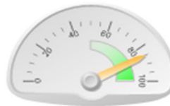
% Victims Satisfied