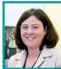
Julia Mulligan Police and Crime Commissioner for North Yorkshire

As a result of the latest review of our joint governance arrangements and internal control environment we intend to make some changes. It is our shared aspiration that the changes that we implement during 2017 / 2018 will allow us to be more flexible in our decision making and empower our people to continue to deliver the best possible service.