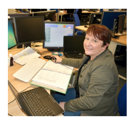
A mental health triage nurse located at the force control room.

In February 2017, North Yorkshire Police launched a road show that toured police stations, the force control room and headquarters to help educate staff about dementia and encourage members of the force to become Dementia Friends using a simple process developed by the Alzheimer's Society's Dementia Friends programme.