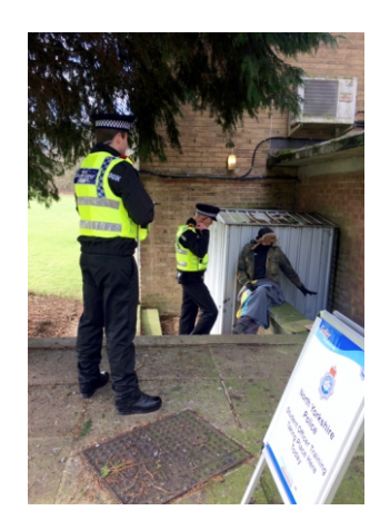
Student officer training