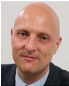
Will Eastwood Police Federation