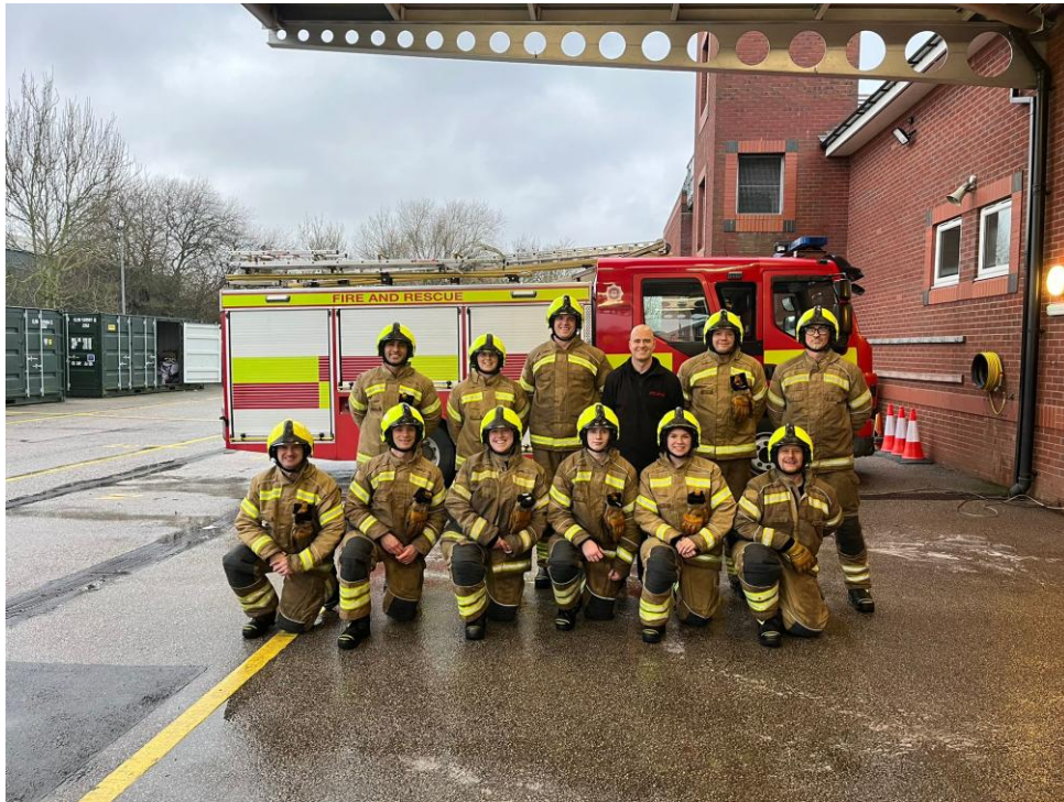
January 2026 On-Call Firefighter Safe to Ride Course

For more information on the role of On-Call Firefighters in North Yorkshire please see our website at - On-Call Firefighter Recruitment – North Yorkshire Fire & Rescue Service